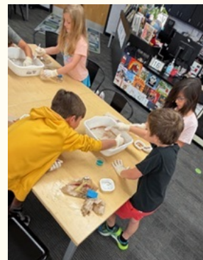
Media Center Earth Day Fun!!