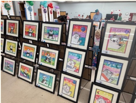
Night of the Arts!