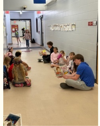
BTBS Football Volunteers!